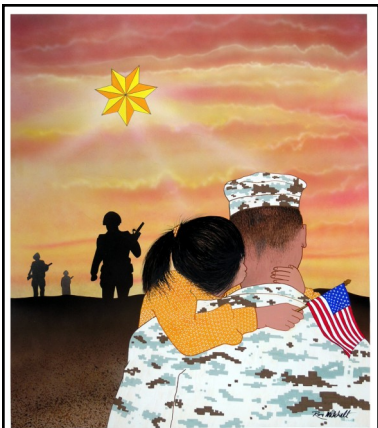
"Welcome Home" 26" x 30"