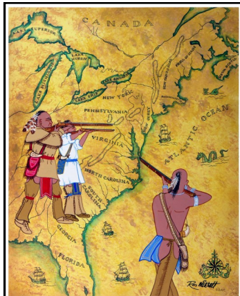
"Cherokee Freedom Fighters" 16" x 20"