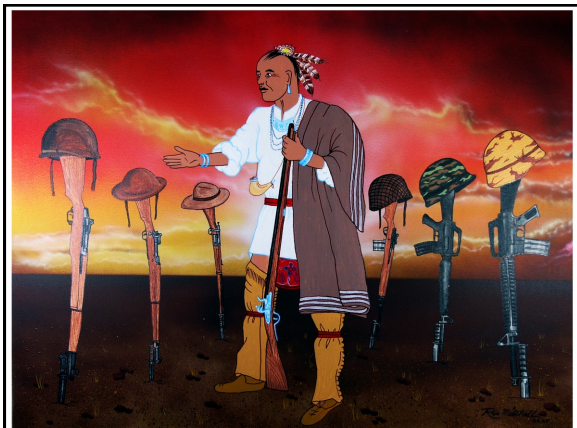
"Cherokee Warriors, Fallen Heroes" 30" x 40"