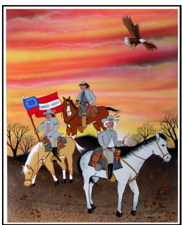
"Cherokee Braves" 16" x 20"